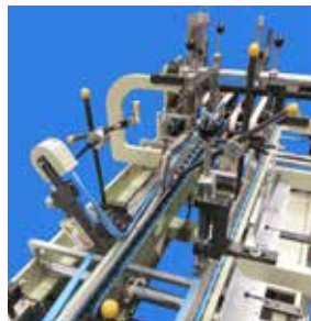
Versatile Pre-Break Section for 180-degree first- and third-score prebreak and compound folding options.