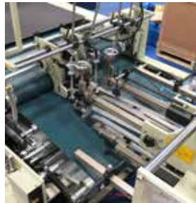
Compression Section includes two-stage pneumatic pressure control for accurate glue bonding.