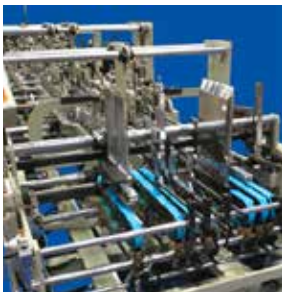
High Performance Feeder Section for accurate carton spacing. Servo motor drive allows for precise spacing out of the feeder. Vacuum and vibrator belts come standard.