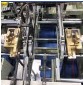
Left and Right Glue Pots are standard for gluing A&B style cartons and adding more versatility. Various width glue wheels available, knurled or smooth.