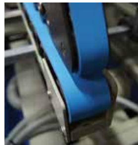
Offset Carrier Belts for strong blank support along a score line, accomplished with lower carrier belts that are wider than the top.