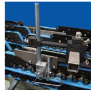
Crash-Lock Bottom Attachments designed as a single-clamping system that can be preassembled and quickly positioned to reduce set-up time.