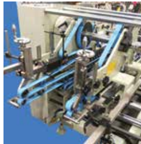
Double Trombone Transfer Station for the optimization of over- and under-stacking, with automatic belt tensioning when repositioning the trombones.