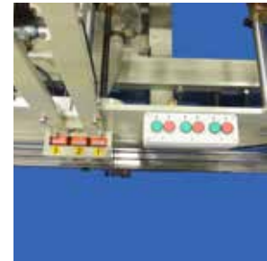
Motorized Carriers with digital indicators for precise and easy make-ready on repeat jobs.