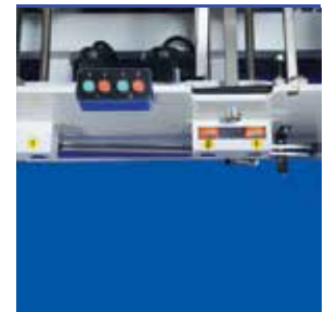
Motorized Carriers with digital indicators for precise and easy make-ready on repeat jobs.