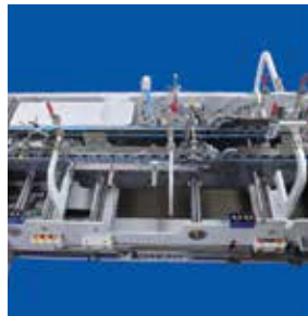
Versatile Pre-Break Section for 180-degree first and third-score prebreak and compound folding options. Includes an extended-height third score pre-break area for large cartons.