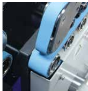
Offset Carrier Belts for strong blank support along a score line, accomplished with lower carrier belts that are wider than the top.