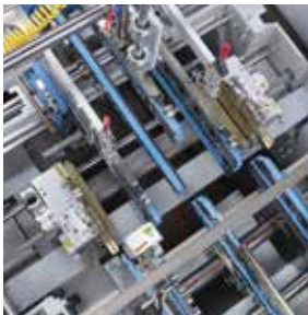
Left and Right Glue Pots are standard for gluing A&B style cartons and adding more versatility. Various width glue wheels available, knurled or smooth.