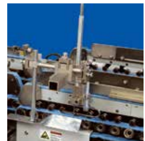
Crash-Lock Bottom Attachments designed as a single-clamping system that can be preassembled and quickly positioned to reduce set-up time.