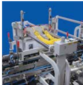
Pneumatic Center Carrier in final fold section allows for faster make-ready for small cartons.