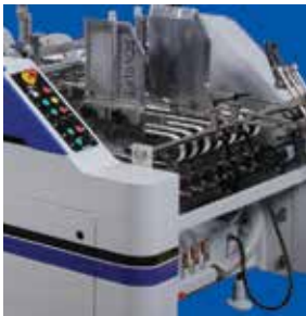
High Performance Feeder Section for accurate carton spacing. Servo motor drive allows for precise spacing out of the feeder. Vacuum and vibrator belts come standard.