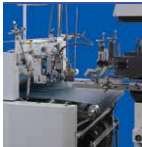
Compression Section includes two-stage pneumatic pressure control for accurate glue bonding.