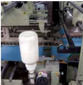
Left and Right Glue Pots are standard for gluing A&B style cartons and adding more versatility. Various width glue wheels available, knurled or smooth.