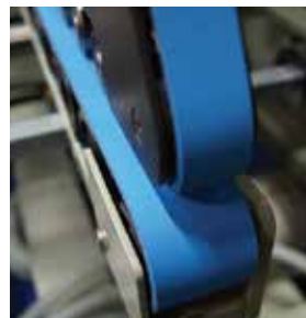
Offset Carrier Belts for strong blank support along a score line, accomplished with lower carrier belts that are wider than the top.