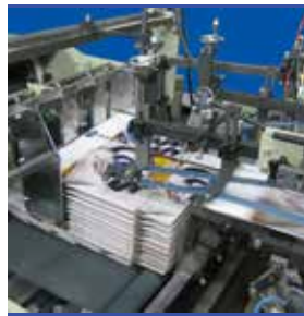
Versatile Multifunction Compression Section where cartons can be understacked, overstacked or pile stacked for proper alignment.