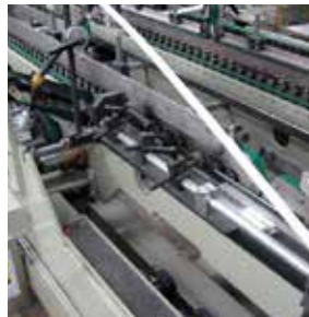
Versatile Pre-Break Section for 180-degree first-and third-score prebreak and compound folding options. Includes an extended-height third score pre-break area for large cartons.