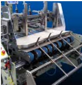
High Performance Feeder Section for accurate carton spacing. Servo motor drive allows for even blank separation.