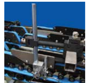
Crash-Lock Bottom Attachments designed as a single-clamping system that can be preassembled and quickly positioned to reduce set-up time.