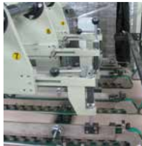
Pneumatic Center Carrier in final fold section allows for faster make-ready for small cartons.