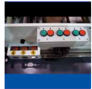
Motorized Carriers with digital indicators for precise and easy make-ready on repeat jobs.